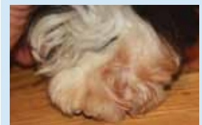
Paw chewing in a dog: Discoloured hair is a sign of excessive grooming.

If your pet gets itchy for no obvious reason, has recurrent ear problems or has a very sensitive stomach – it could be an allergy, so please come and see us for a check-up!