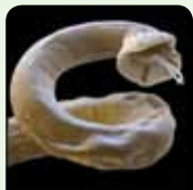
Electron micrograph of an adult lungworm

This is a problem for dog owners since dogs may unwittingly swallow infected snails and slugs (or their slime trails) whilst exploring parks and gardens. Once swallowed, the larvae migrate to the heart where they will develop into adult worms.